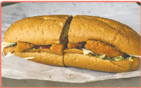
Nada Chicken at ThunderCloud