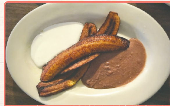
Platanos fritos at El Sunzal