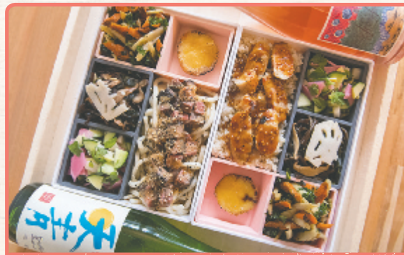
A bento box at Bento Picnic